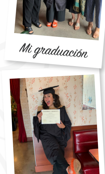
/ did it!

Gracias for everything you do in support of our vision. We are so grateful that you can see it too.